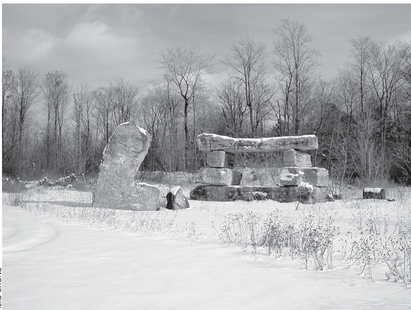
Quarry rocks piled high

1.25 The trail turns right on the old road and enters the OSI Thacher Park Nature Preserve.