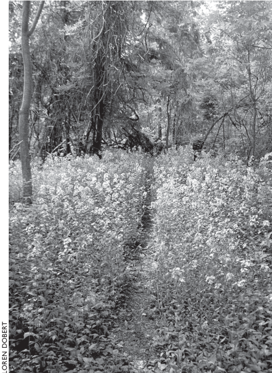
Wildflowers growing near the ranger station

1.00 Halfway northwards along the edge of the second field, the trail turns right into the woods. Many narrow fissures, some very deep, crisscrossing the woods and mark this section of trail. The trail parallels and then crosses a stone wall to reach an old woods road, the end of park property.