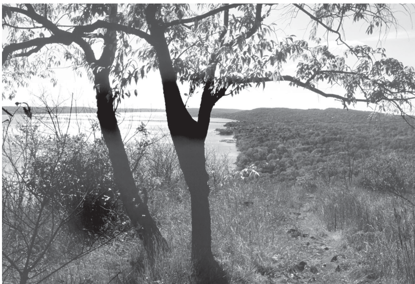
View from Hook Mountain

Many fine views occur as the trail trends downward along a broad woods road on the west side of Hook Mountain's ridge. As the trail approaches the recreation areas of Rockland Lake State Park, it passes an old stone wall and several unmarked trails leaving on both sides. After a final steep descent, reach Landing Hill Road.