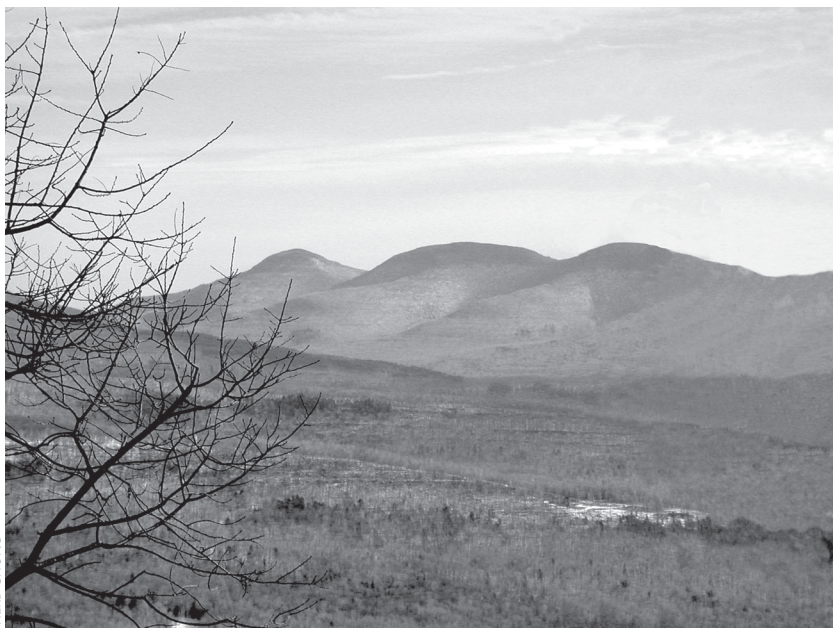
The Blackhead Range from Richmond Mountain

road joins from the right. The trail continues ahead to the left.