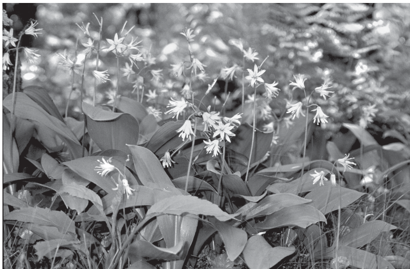
Wildflowers by the trailside

As the Long Path heads west and then north, the tall mountains of the Catskills are soon left behind; they become lower and lower until they are mere hills standing above the plain. Much of the trail now parallels the Schoharie Valley, an important route into the Catskills from points north. Early Dutch settlers made their homes here; there are many reminders of their past in the names of the places one passes. A major feature of the area is the reservoir complex maintained by the New York State Power Authority. In addition to hydroelectric power, the Schoharie Reservoir is a member of the great Catskill water reservoirs that supply distant New York City with clean drinking water.