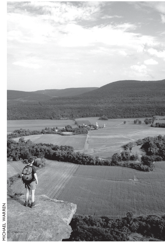
View from Vroman's Nose

turns left and heads uphill along the stream in a deep hemlock forest.