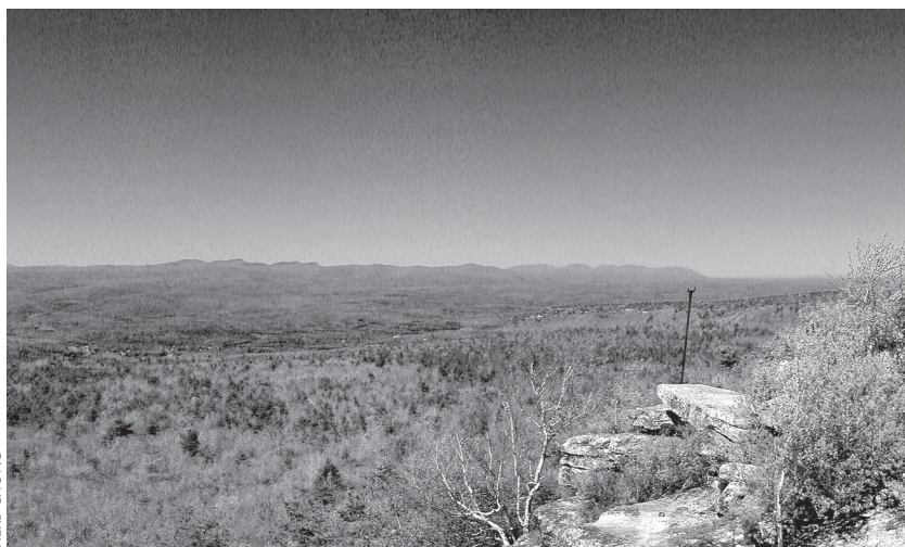
The Southern Catskills from High Point, Minnewaska State Park